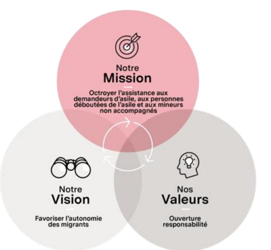
Figure 2 :EVAM's three poles to accomplish their objective

Its main objective being to favor migrants' autonomy by giving them professional support. To get to their objectives, EVAM has 3 different poles: Mission, Vision, and Values (see Fig.2). More information regarding these three poles can be found in Annex 3.