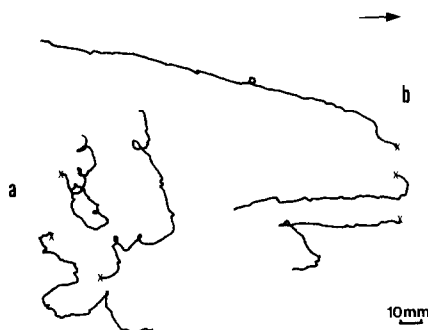
Fig. 2. Track records (60 s) of three Varroa a) in a humidified airstream, b) the same bearing PA ( 2.5\text{-}\mu\text{g} source). Arrow: direction of airflow; x: starting point of path

Palmitic acid has been identified in adult honeybee cuticle [10] and, in addition, is suggested to be of use for chemical camouflage by the bee-colony-invading moth Acherontia atropos [11]. PA functions as a phagostimulant for the hide beetle, Dermestes maculatus , as well as for other insects ([12] and references therein). According to one hypothesis [13] concerning optimal search strategies in the absence of odors, crosswind walking is expected under constant wind direction, and upwind or downwind walking