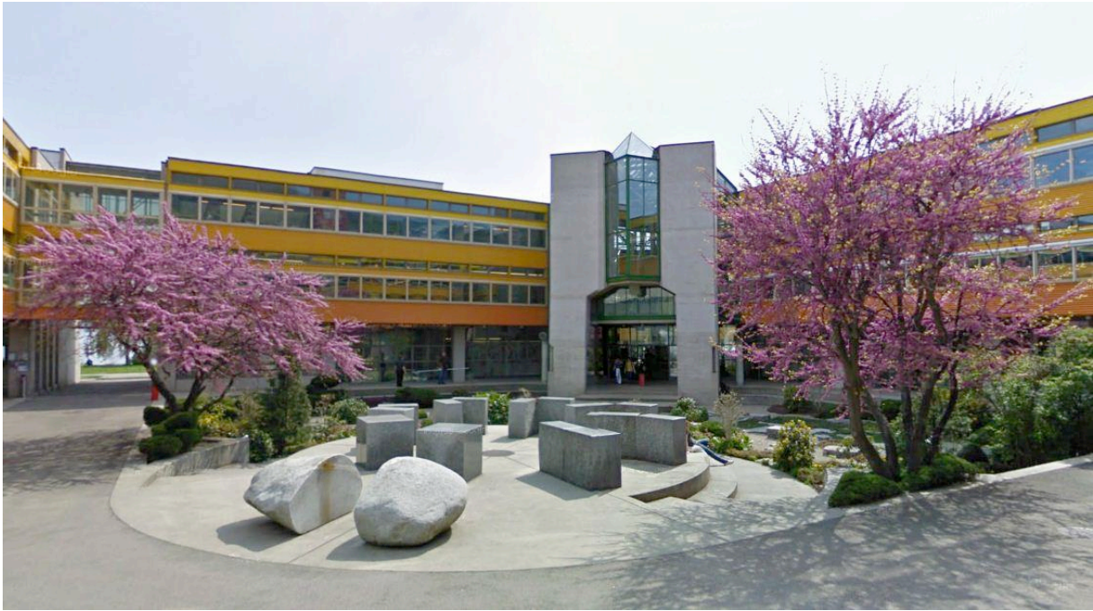
Picture of the building at Espace Louis Agassiz 1, main entry.