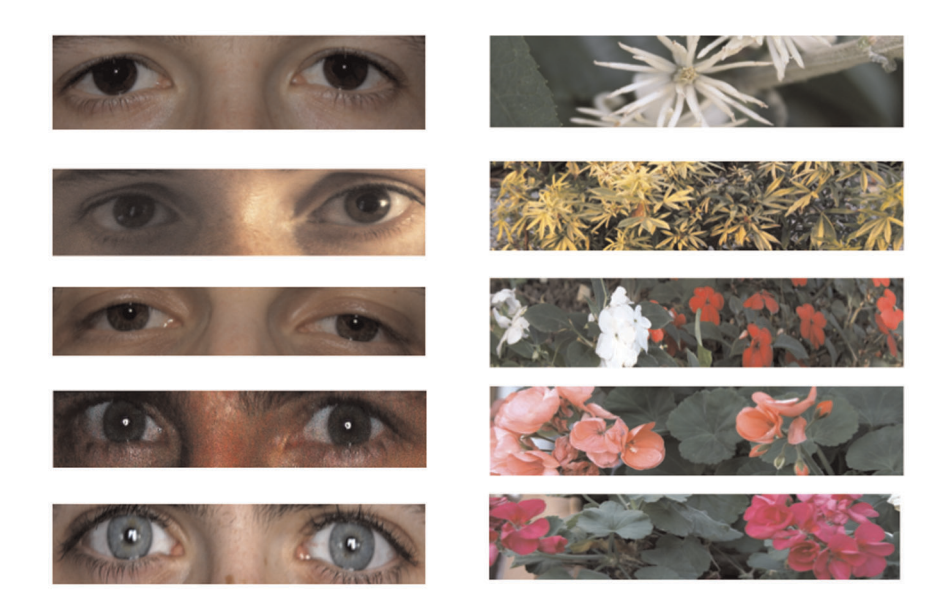
Figure 2. Treatments (images of eyes) and controls (images of flowers). doi:10.1371/journal.pone.0037397.g002

garbage are neutral to the treatment in the sense that it is not possible to assess the effects of the treatment on their behaviour. In a first step, we tested whether individuals invested more time in handling garbage in the presence of images of eyes compared to the control. In a second step, we investigated whether the amount of time invested was positively correlated to the number of items handled, the number of items place into the correct bin or, the proportion of items placed into the correct bin (precision). Because of the low sample size of people that were willing to respond to our questionnaire, we included all available responses to the questionnaire in the analyses, including those of people that were excluded from the behavioural analyses because of methodological considerations (e.g., when the person was not alone during two minutes after arrival). As some individuals left with the bus before they had answered the full questionnaire we do not have the same amount of answers for each question (between 18-30 answers per question could be analysed). All results reported are two-tailed and were performed with SPSS version 16.0. P-values<0.05 are considered as statistically significant and p-values \geq 0.05 but <0.1 are reported as non-significant trends.